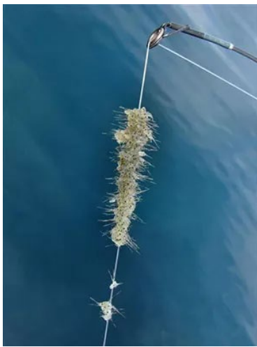
Figure 2. Spiny water flea on a fishing line.